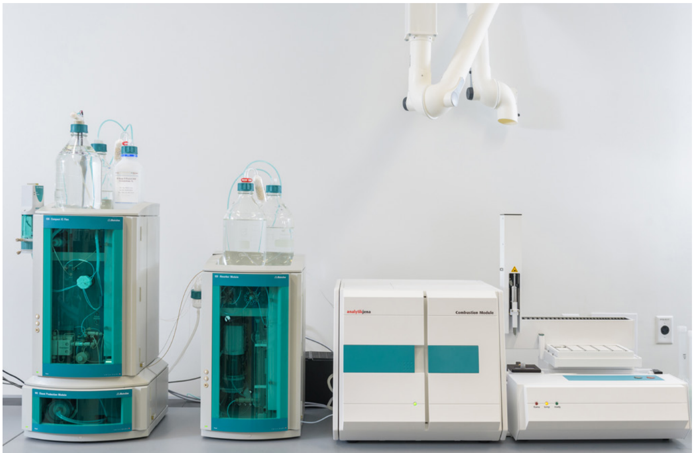
Figure 2. Profiler F Analyzer for AOF.

With increased concern over the environmental and health risks of PFAS compounds, accurate monitoring of these compounds is essential. The Profiler F Analyzer for AOF can reliably test non-targeted adsorbable organic fluorine (AOF) as per EPA Draft 1621. This can be done with increased sensitivity down to an MDL of 1.36 ppb, while demonstrating repeatability and accuracy to meet the proposed requirements of EPA Draft Method 1621.