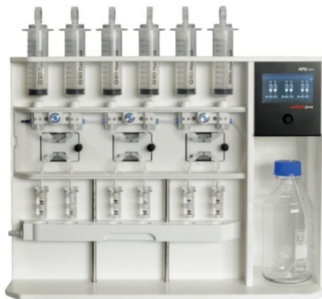
Figure 1. Analytik Jena APU Sim.

This analysis is performed by using the Metrohm Profiler F Analyzer for AOF, a combustion ion chromatography system optimized for fluorine analysis (Fig.2). Using an eluent concentration of 3.2 mM sodium carbonate and 1.0 mM sodium bicarbonate, and 1 mL injection volume, samples are separated with the Metrosep A Supp 7 150/4.0 column connected to the Metrosep A Supp 5/4.0 guard. This allows for anion detection of peaks with sequentially suppressed conductivity detection and quantification at a calibration range of 0.5 to 50 ppb. All instrument control and data processing are performed using MagIC Net 4.0 software.