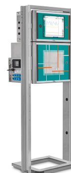
Figure 2. The 2060 The NIR-Ex Analyzer from Metrohm Process Analytics can measure %NCO in the PU production process in near real-time.

A safe and efficient method to monitor %NCO in near real-time is reagent-free NIR spectroscopy. The Metrohm Process Analytics 2060 The NIR-Ex Analyzer offers inline analysis capabilities using transreflectance and a micro interactance immersion probe. These probes are connected to optical fibers that allow the analyzer to be set up more than 100 meters away from the sampling point and still benefit from fast analyses. Additionally, this analyzer allows the connectivity of up to two NIR cabinets to one 2060 Human Interface, expanding the measurement points to ten sample streams (five for each cabinet). This gives users more savings per measurement point.