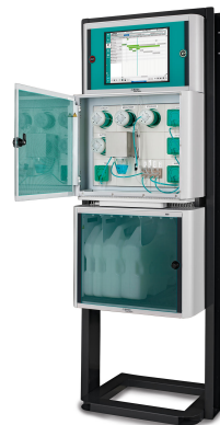
Figure 2. 2060 CVS Process Analyzer from Metrohm Process Analytics.

Automation of sample preconditioning and analysis steps minimizes human error and improves consistency. This process analyzer eliminates the need for manual handling of harsh chemicals, improving safety in the plant. Finally, customizable alarm and intervention settings based on the obtained results enable proactive process control. By incorporating the 2060 CVS Process Analyzer, a more comprehensive understanding can be achieved about the PCB manufacturing process and consistent product quality can be ensured.