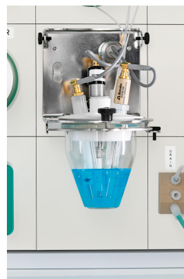
Figure 3. Close-up of the electrochemical cell in the 2060 CVS Process Analyzer.

The 2060 CVS Process Analyzer ensures optimal